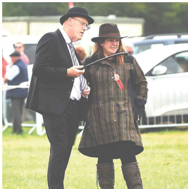
Judging at the Cork Summer Show at the Showgrounds Curraheen.